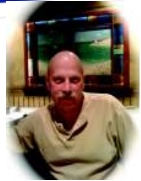
Your Arrangements Chair: djkrasowski@yahoo.com

The Main Presentation discussed a case study in a Lean workout for a Total Productive Maintenance blitz. The essential elements of this activity include assembling the appropriate team players, selecting the right project, getting close to the equipment, root cause analysis, and finding improvements that have the most impact with